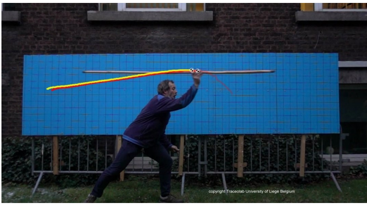
Fig. 1 Hand-cast javelin. In yellow, the trajectory of the grip point of the javelin and in red, hand-travel between the beginning and the end of the propulsion action.