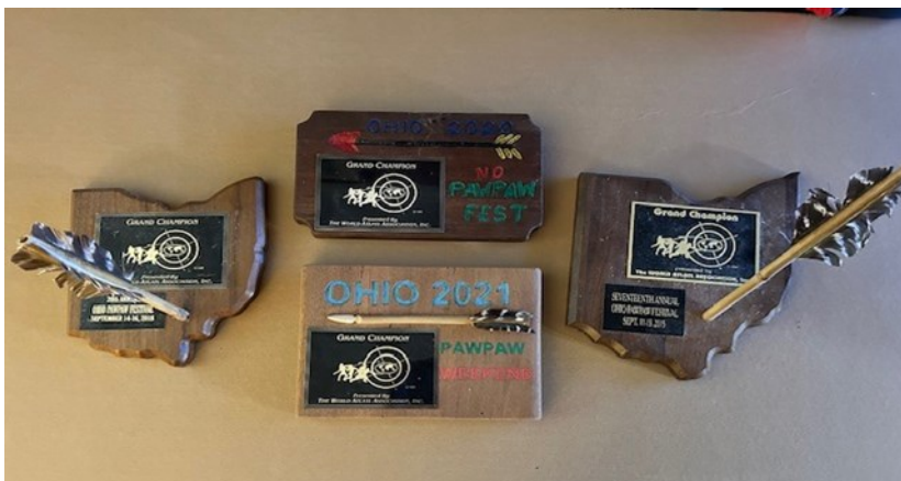
Sample PawPaw and Dam ISAC Championship Awards.