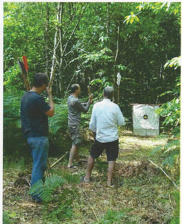
Somewhere in darkest East Sussex