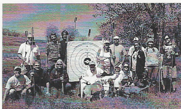
Wyoming - 2011

2. Teams of 3 throwers on a flight, using an ISAC target with an ISAC score sheet.